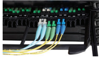
24 LC MPO Cabled Module

to the system without sacrificing any of the available LC or SC terminations. The splice chassis will hold up to 48 splice trays, which accommodates 72 fibers using ribbon splicing for a total of 3456 splices per frame.