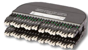
Triple High NG4access VAM