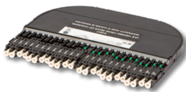
Single High NG4access VAM

Note: Most splitter modules will occupy one tray in the NG4 universal chassis. 1x32 splitters will occupy three trays.