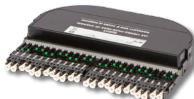
Double High NG4access VAM