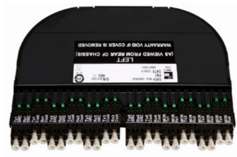
All Front Port Configuration

NG4-VMMLF4A (NG4access VAM Monitor, LC UPC, Left Orientation, All front ports, four circuits, 90/10 tap ratio)